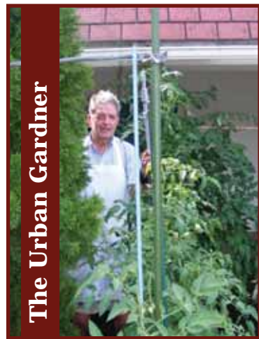
The Urban Gardener