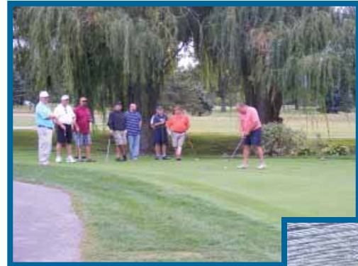
The Chamber lucked out with a perfect fall day for the annual Don Billman Memorial Golf Outing at Sawmill Golf Club.