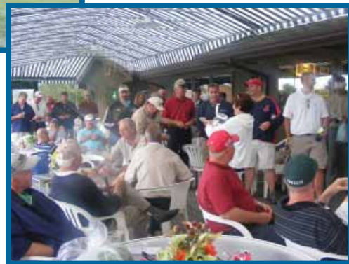
Some tall tales were spun about the tee shot that came so very close to the pin during dinner, door prizes and awards at sunset on the patio at Mulligan's Pub.